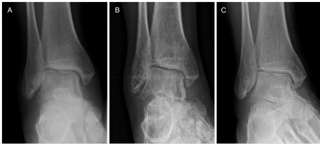
Figure 1: Mortise projections of the right ankle. After persisting ankle pain, on 3-month follow-up, the radiographs were interpreted as normal with no signs of osteonecrosis (a). On 4-week post-procedure clinical follow-up, the ankle was painless, but due to restricted weight-bearing, the mineral density of the ankle had decreased as seen on radiographs (b). On the last follow-up (15 months after the procedure), the ankle was symptomless and radiographs were interpreted as normal (c).

radiographic sclerosis develops in the infarcted bone, corresponding low signal on both T1- and T2-weighted images can be detected. The reparative zone between necrotic tissue and viable granulation tissue represents the “double-line sign,” a low-signal rim in which the inner aspect becomes high signal on T2-weighted images [4, 8]. Many classification systems for osteonecrosis exist, and the Association Research Circulation Osseous (ARCO) system was selected for this case report [9]. To the orthopedic surgeon, the osteonecrosis of the talus represents a dilemma; while several treatment options exist, the outcomes have remained suboptimal [10]. Moreover, while a plethora of treatment choices is available - including restricted weight-bearing, bracing, bone grafting, core decompression, talectomy, and arthrodesis - no consensus for the ideal treatment strategy for the talar osteonecrosis exists [10]. Here, we report a successful treatment of early osteonecrosis of the talus (ARCO Stage I) using core decompression combined with intraosseous stem cell and platelet-rich plasma (PRP) injection. This technique has been introduced by Hernigou and