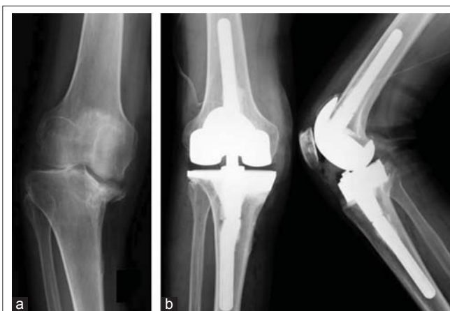
Figure 2: (a) Radiograph of the right knee showing severe varus deformity of the knee joint, (b) radiographs showing total knee arthroplasty using LCCK® (Zimmer Biomet, Warsaw, IN, United States).

Miki et al. reported five calcaneus fractures after total joint arthroplasty. In this study, the occurrence was <1%, and the risk factors for fracture were increased age, female sex, and osteoporosis. These calcaneus stress fractures occurred 6-10 weeks after TKA [4]. However, in this case, the patient was a relatively young man. His bone mineral density (femur) was 0.701 g/cm 2 and his young adult mean was 81%; therefore, the diagnostic criteria for osteoporosis were not fulfilled. Thus, it was considered that his calcaneal stress fracture was not caused by osteoporosis but related to some pathological factors.