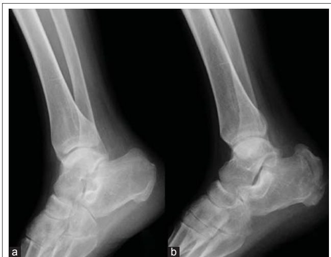
Figure 3: (a) Radiograph of the right heel 4 weeks after total knee arthroplasty, showing no signs of fracture, (b) radiograph of the right heel 5 weeks after total knee arthroplasty, revealing a displaced calcaneus avulsion fracture.