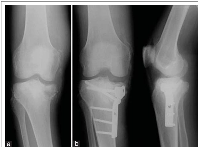
Figure 1: (a) Radiograph of the right knee, showing a semi-acute depression fracture of the tibia with the lack of bone and some intra-articular loose bodies, (b) radiographs showing open reduction and internal fixation using a conventional non-locking plate.

The cause of calcaneus stress fractures after TKA has not been clearly understood; however, five mechanisms are considered: (1) The fragility of the calcaneus, caused by low activity preoperatively, (2) increased load on the calcaneus accompanying hyperactivity after a TKA performed to relieve knee pain, (3) marked change in the alignment of the lower extremity, (4) changing the foot contact point from the toes to the heel, and (5) strong traction force of the triceps surae muscle.