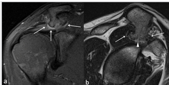
Figure 3: Coronal oblique TSE T2w image (a): The osseous prominence (white arrows) determines edema and posterior dislocation of supraspinatus belly that does not show any signs of fatty infiltration. Sagittal oblique TSE T2w fat-sat image (b): osteochondroma (white arrows) shows partial erosion of the central zone of cartilage cup (white arrowhead).

Plain radiography of the shoulder shows a bony prominence protruded inferiorly from the undersurface of the clavicle with the reduction of subacromial sliding space (Fig.1). Computed tomography images better show osseous prominence near acromioclavicular joint with the cortical connection. This lesion has a maximum diameter on the coronary plane of 22 mm and on the sagittal plane of 26 mm with cortical implant of 9 mm (Fig.2). Magnetic resonance imaging examination revealed the cartilage cap of the exostosis which, at the center zone, shows irregular continuous solution extended to the underlying