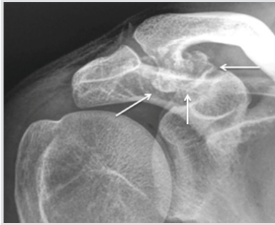
Figure 1: Anteroposterior radiograph showing an irregular osseous prominence projection arising from the undersurface of the clavicle (white arrows).